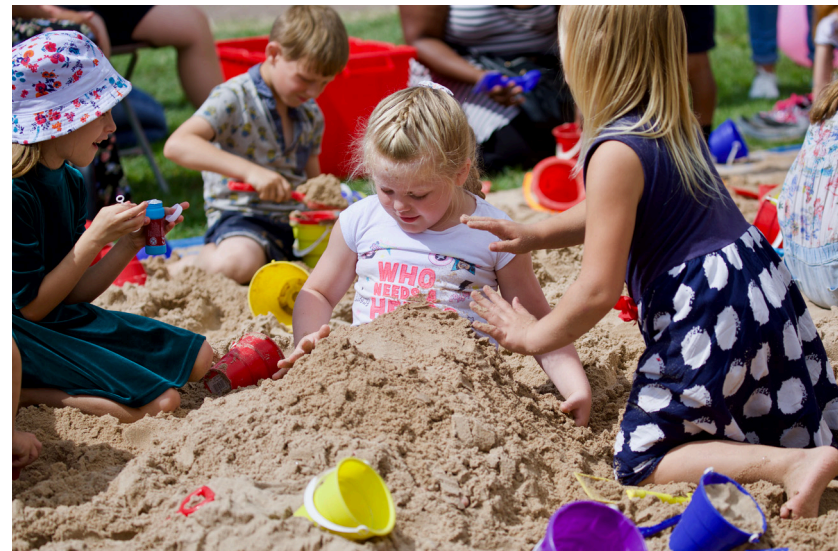
Coalville by the Sea event

Take unnecessary risks with public money or lose our core public sector ethos.